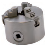
Chuck assembly 3-jaw chuck \varnothing 65