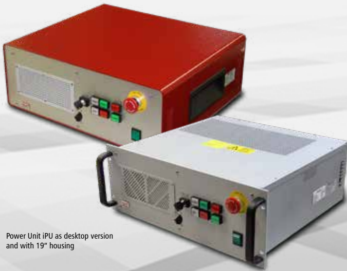
Power Unit iPU as desktop version and with 19" housing